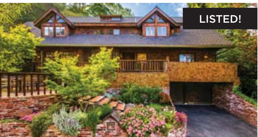
1220Woodborough.com I 1220 Woodborough Rd, Lafayette 4 Bed I 3.5 Bath I 4630 SF I 1.06 AC Offered at $2,875,000