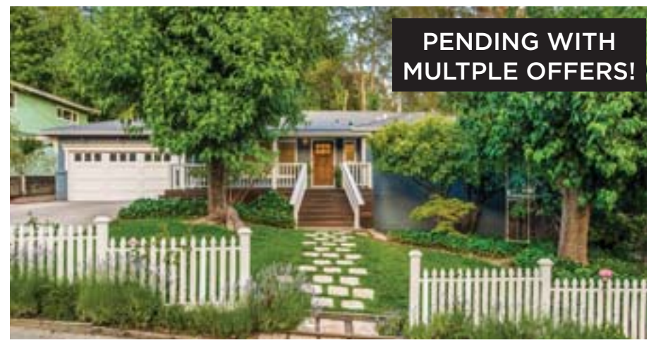
3256Sweet.com | 3256 Sweet Dr, Lafayette 3 Bed | 2 Bath | 1420 SF | .22 AC Offered at $1,380,000